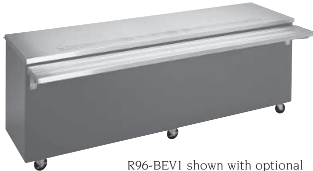
R96-BEV1 shown with optional solid ribbed tray slide

Designed to keep your serving area clean and functional, these Piper Beverage Counters are sure to complete your line-up. The standard full length drains will keep hazardous spills from your floors. Units are a full 30" deep to accommodate nearly all coffee makers.